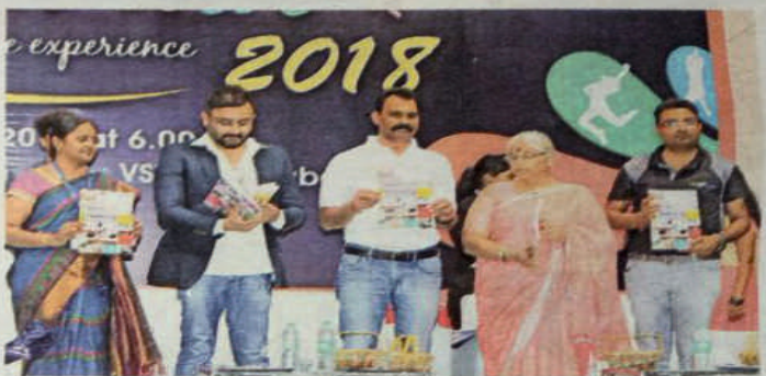
కళాశాల స్టూడెంట్ లెటర్స్ పుస్తకాన్ని ఆవిష్కరిస్తున్న వక్తలు